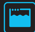
Built-in Water Tank