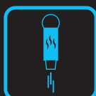
Separate Hot Water