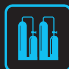
Dual Boilers & Dual Pumps